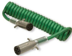
Alliance ABS Cable APB N54A SFA155CE $59.39