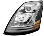
Trux Incandescent Headlights TLED-H45 and others $243.99