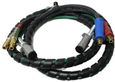
Alliance 3-in-1 Power Line 15' APB N42AAPL15 $140.66