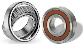
Alliance Bearings ABP SBN SET413 $22.45 ABP SBN SET406 $15.45