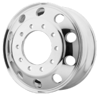
Alliance Aluminum Wheel ABP N40A 225825 659SP 45 $275.61