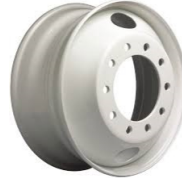
Refurbished White Steel Wheels 2-hole and 5-hole; sandblasted & powder coated $70.00