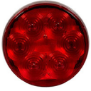
Maxxima 4-inch 6 LED Lamp M42346R $8.21