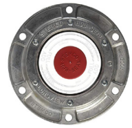
Stemco Trailer Hub Cap STM 340 4009 $16.31