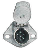
Phillips 7-Way Socket PHM 15 720 $11.42