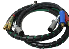
Alliance 3-in-1 Power Line