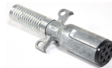
Phillips 7-Pin Plug