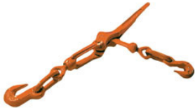
Lever Chain Binder