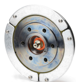
Horton Clutch, Rear Air K32 Dual Pilot HOR 9908504

Deal applies to hundreds of part numbers, including our fastest-selling parts below. Through 9/30.