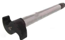
Meritor Camshaft TDA 2210A7671; TDA 2210H7678; TDA 2210J7680; TDA 2210T7482; TDA 2210U7483; TDA 2210Z7670; TDA R607326; TDA R607325 Thru 10/31