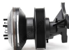
Horton Clutch Drive Master, Reman HOR 79A9223