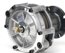
Horton Fan Clutch HT 650 HOR 991450