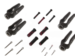
Meritor Clevis Kit TDA R810019 Thru 10/31